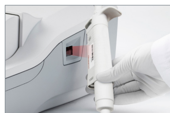
2. Scan pipette