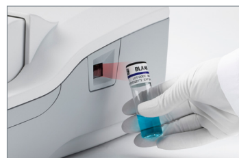
3. Scan calibration solutions